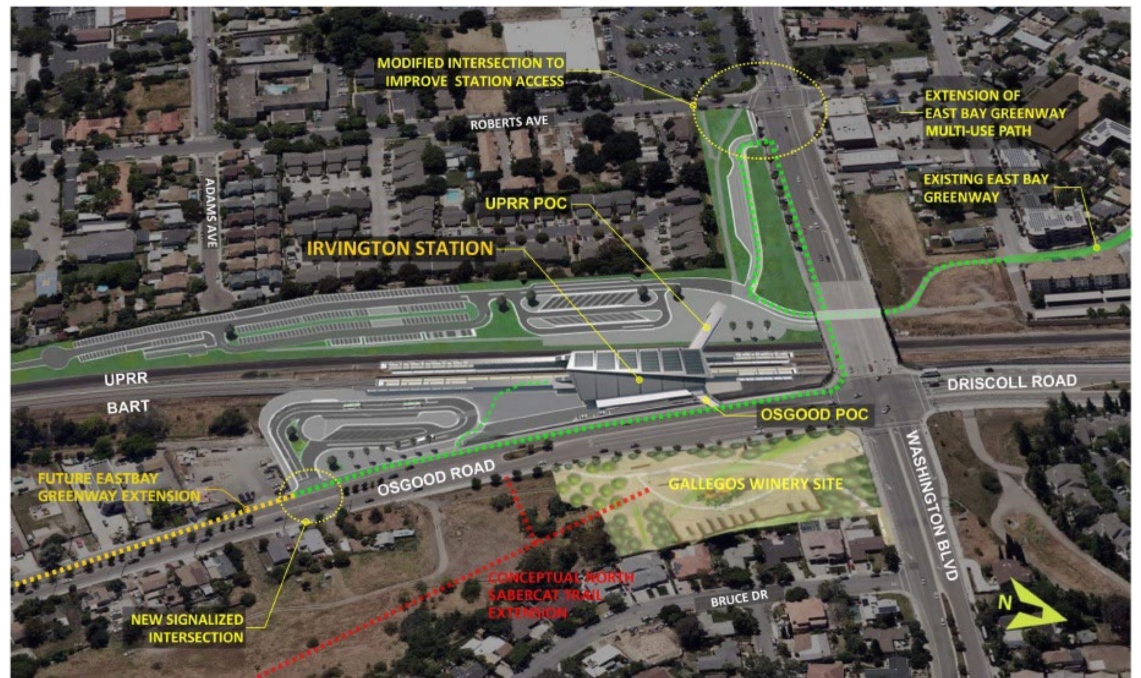
Project location and scope of improvements.